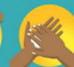
RUB HANDS TOGETHER