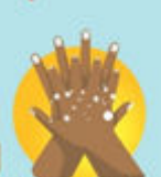
LATHER THE BACKS OF YOUR HANDS AND BETWEEN YOUR FINGERS