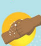
RUB THE BACKS OF FINGERS ON THE OPPOSING PALMS