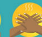
COVER ALL SURFACES UNTIL HANDS FEEL DRY