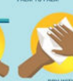
DRY WITH A SINGLE USE TOWEL