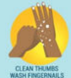
CLEAN THUMBS WASH FINGERNAILS AND FINGERTIPS