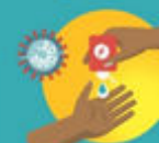
APPLY THE PRODUCT ON THE PALM OF ONE HAND