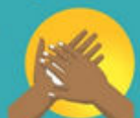
RUB HANDS TOGETHER