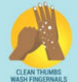
CLEAN THUMBS WASH FINGERNAILS AND FINGERTIPS