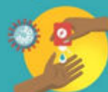
APPLY THE PRODUCT ON THE PALM OF ONE HAND