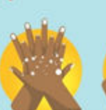
LATHER THE BACKS OF YOUR HANDS AND BETWEEN YOUR FINGERS