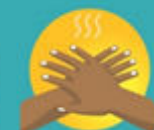
COVER ALL SURFACES UNTIL HANDS FEEL DRY