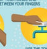
USE THE TOWEL TO TURN OFF THE FAUCET