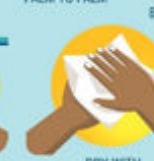
DRY WITH A SINGLE USE TOWEL