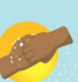
RUB THE BACKS OF FINGERS ON THE OPPOSING PALMS