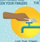
USE THE TOWEL TO TURN OFF THE FAUCET