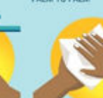
DRY WITH A SINGLE USE TOWEL