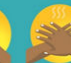
COVER ALL SURFACES UNTIL HANDS FEEL DRY