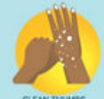
CLEAN THUMBS WASH FINGERNAILS AND FINGERTIPS