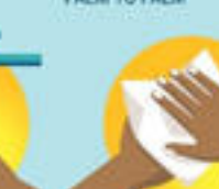
DRY WITH A SINGLE USE TOWEL