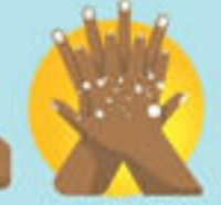
LATHER THE BACKS OF YOUR HANDS AND BETWEEN YOUR FINGERS