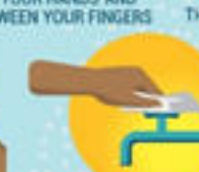
USE THE TOWEL TO TURN OFF THE FAUCET