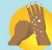
CLEAN THUMBS WASH FINGERNAILS AND FINGERTIPS