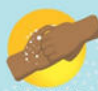
RUB THE BACKS OF FINGERS ON THE OPPOSING PALMS