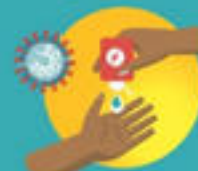
APPLY THE PRODUCT ON THE PALM OF ONE HAND