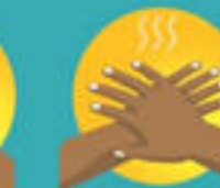
COVER ALL SURFACES UNTIL HANDS FEEL DRY