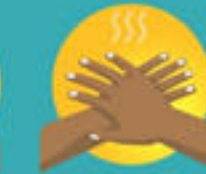
COVER ALL SURFACES UNTIL HANDS FEEL DRY