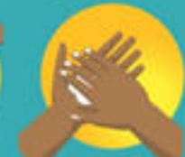
RUB HANDS TOGETHER