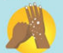
CLEAN THUMBS WASH FINGERNAILS AND FINGERTIPS