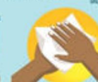
DRY WITH A SINGLE USE TOWEL