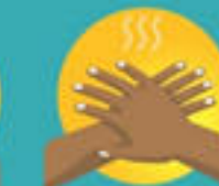
COVER ALL SURFACES UNTIL HANDS FEEL DRY