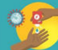
APPLY THE PRODUCT ON THE PALM OF ONE HAND