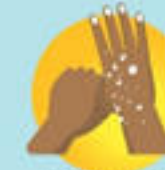
CLEAN THUMBS WASH FINGERNAILS AND FINGERTIPS