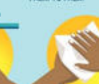
DRY WITH A SINGLE USE TOWEL