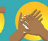
RUB HANDS TOGETHER