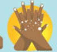
LATHER THE BACKS OF YOUR HANDS AND BETWEEN YOUR FINGERS