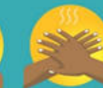
COVER ALL SURFACES UNTIL HANDS FEEL DRY