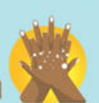
LATHER THE BACKS OF YOUR HANDS AND BETWEEN YOUR FINGERS