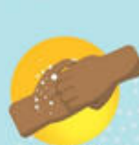
RUB THE BACKS OF FINGERS ON THE OPPOSING PALMS