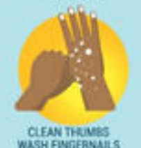
CLEAN THUMBS WASH FINGERNAILS AND FINGERTIPS