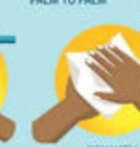
DRY WITH A SINGLE USE TOWEL