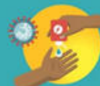
APPLY THE PRODUCT ON THE PALM OF ONE HAND