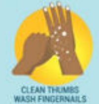
CLEAN THUMBS WASH FINGERNAILS AND FINGERTIPS