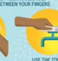
USE THE TOWEL TO TURN OFF THE FAUCET