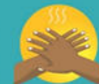
COVER ALL SURFACES UNTIL HANDS FEEL DRY