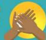
RUB HANDS TOGETHER