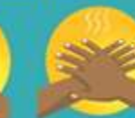
COVER ALL SURFACES UNTIL HANDS FEEL DRY