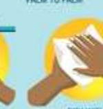
DRY WITH A SINGLE USE TOWEL