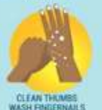
CLEAN THUMBS WASH FINGERNAILS AND FINGERTIPS