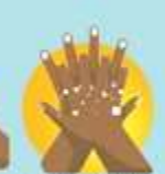
LATHER THE BACKS OF YOUR HANDS AND BETWEEN YOUR FINGERS