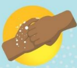
RUB THE BACKS OF FINGERS ON THE OPPOSING PALMS