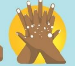
LATHER THE BACKS OF YOUR HANDS AND BETWEEN YOUR FINGERS