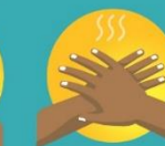
COVER ALL SURFACES UNTIL HANDS FEEL DRY