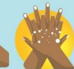
LATHER THE BACKS OF YOUR HANDS AND BETWEEN YOUR FINGERS