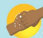
RUB THE BACKS OF FINGERS ON THE OPPOSING PALMS