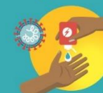
APPLY THE PRODUCT ON THE PALM OF ONE HAND